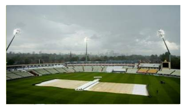
The Royal London One-Day Cup fixture between Derbyshire and Warwickshire at Edgbaston was abandoned without a ball bowled.

Heavy rain over Birmingham over the last few days meant that the outfield at Edgbaston was extremely wet and intermittent showers throughout the day left the umpires with no other choice than to abandon the match at 2pm.